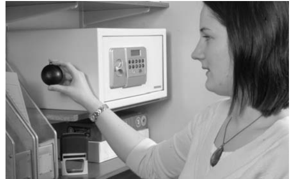
Passive radon detector being placed